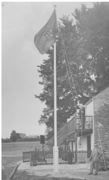
Mr Tuckwell, of outfitters Pinder and Tuckwells, raising the school flag at the opening of the Salmon Pool Lane pavilion, 1929.