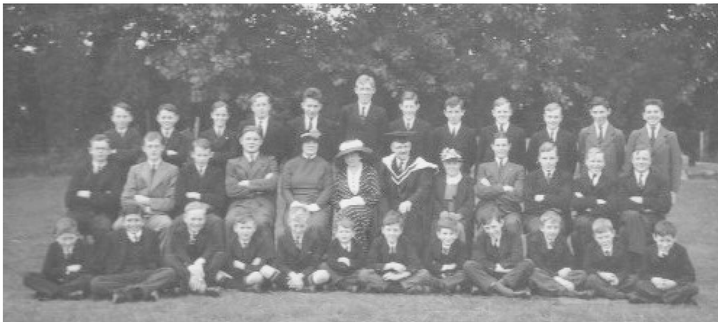
Any ideas when this group photo was taken? We believe it may be late 1930s or early 1940s.